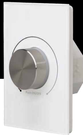
DGDALIDM for dimming

The DALI Wall Plate dimmer range offers a solution to both dimming and simple colour temperature control.*