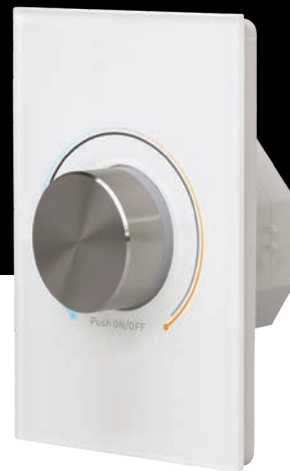
DGDALIDM8 for dimming and colour temperature control*